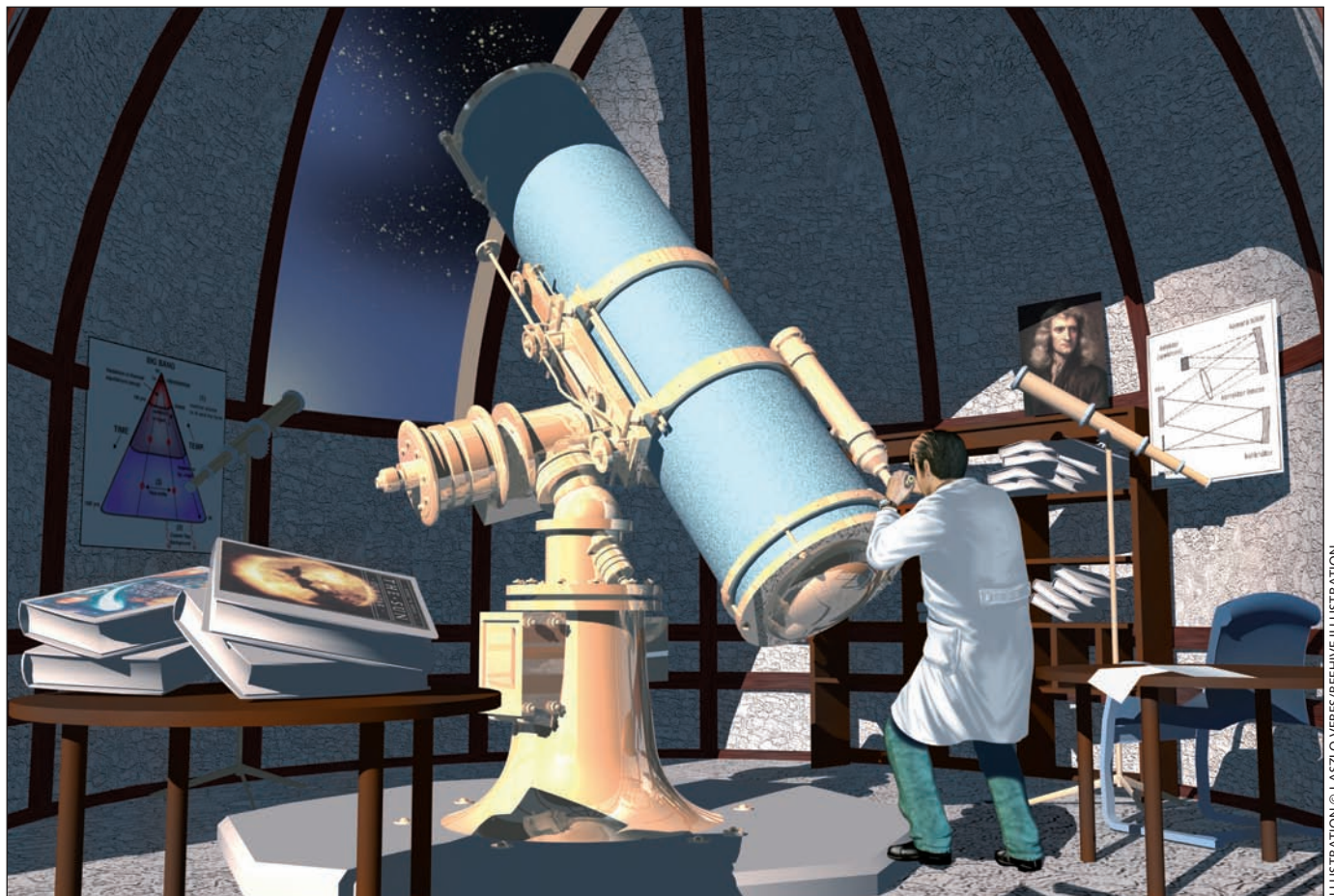
ILLUSTRATION © LASZLO VERES/BEEHIVE ILLUSTRATION