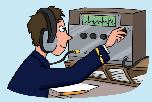
He listens to the ship's radio .