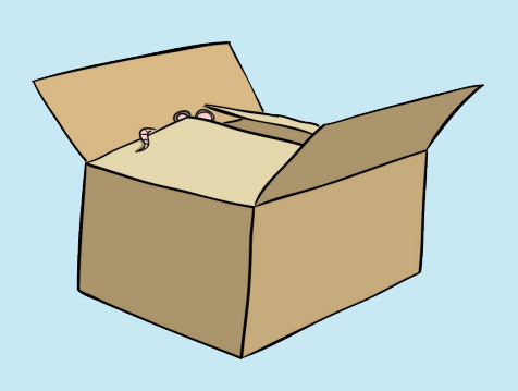
What's in the box ?