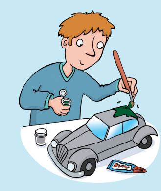
He is making a \mathbf{model} of a car.