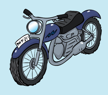
This is a motorbike.