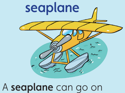
A seaplane can go on the water.