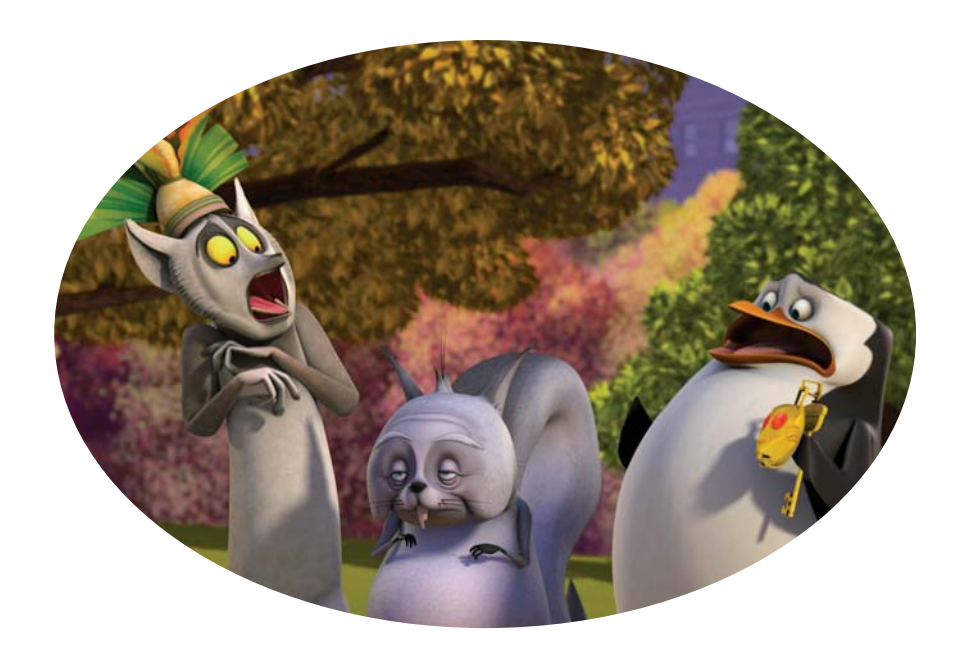
Suddenly they see Granny Squirrel. 'Find the treasure, but look out!' she says. 'The treasure is a trap!'