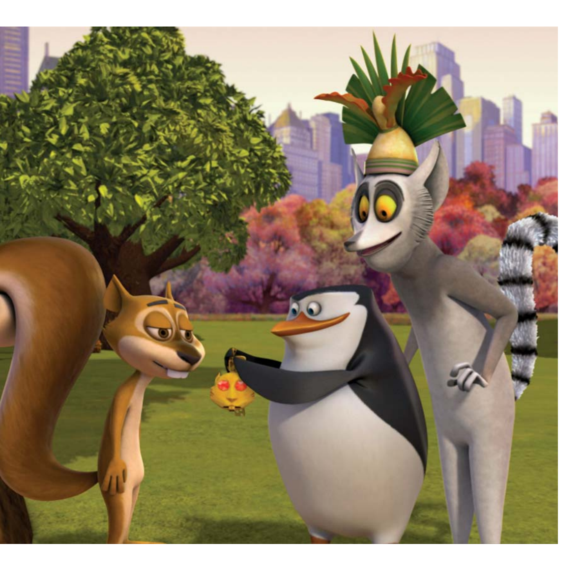
'Where's the treasure?' asks King Julien. 'Let's ask Fred,' says Skipper. 'He's a squirrel.'