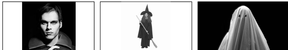
5 _____ 6 _____ 7 _____