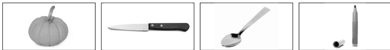
a pumpkin a knife a big spoon a pen