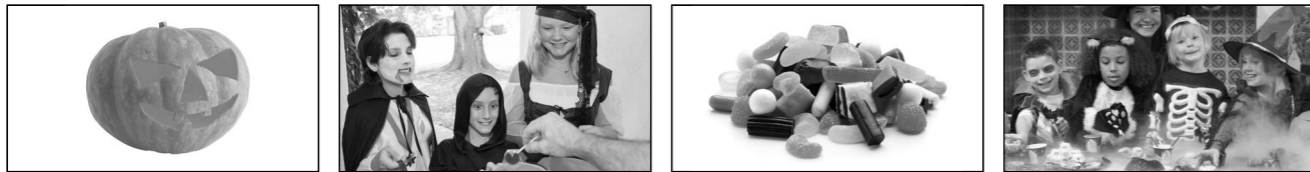
1 pumpkin 2 _____ 3 _____ 4 _____