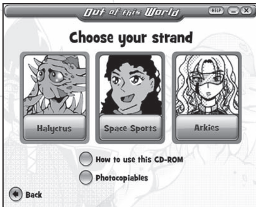
Main menu: click on a strand (for example, Halycrus).