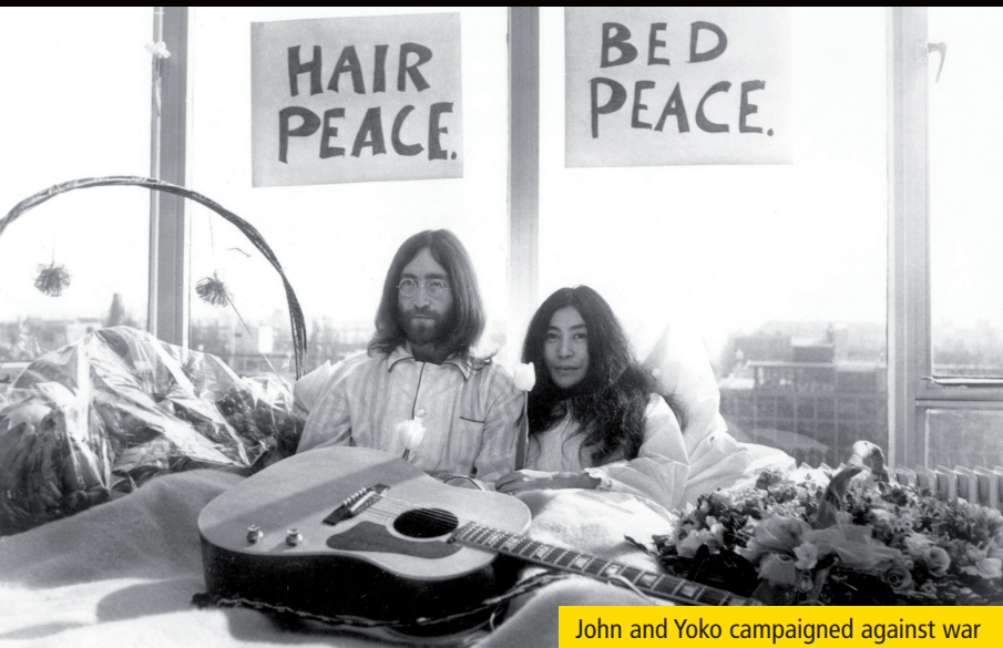
John and Yoko campaigned against war

The Beatles' success in the 1960s was built on a balance between their different characters, especially John and Paul's. But that balance could not last forever. In the 1970s, John faced life after the Beatles.