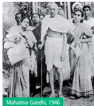
Mahatma Gandhi, 1946

But Gandhi couldn't get independence peacefully. An independent India meant