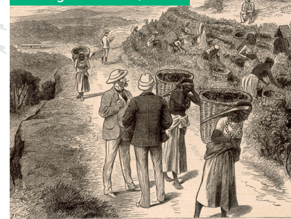
Picking tea in India, 1880

a Hindu India and many Muslims wanted their own Muslim state. In 1947, the decision was made to divide the country into two parts – one for Muslims (the new country of Pakistan) and one for Hindus. Gandhi knew this would be terrible for India and he was right. It was no longer safe for Muslims and Hindus to live in the same areas. Hundreds of thousands of people were killed as they tried to escape from their homes.