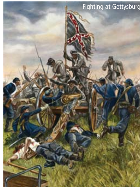
Fighting at Gettysburg

The 'Gettysburg Address': There was terrible fighting at Gettysburg, Pennsylvania, during the Civil War. After the war, Lincoln made a famous speech there. The dead did not die for nothing, he said. They died for people to be free.