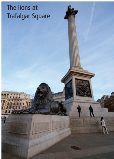
The lions at Trafalgar Square